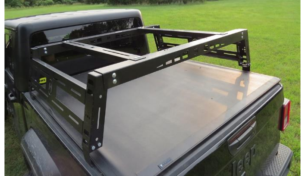
Optional Tonneau Cover Mount Bracket